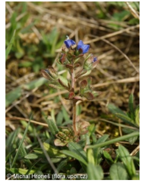
Michal Hroneš (flora.upol.cz)